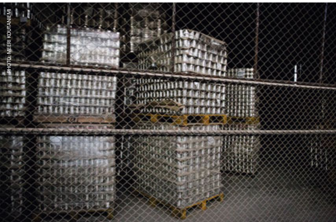
Vita Food Factory storage.

According to interviewed workers, the factory gives workers training for audits. When auditors interview workers the workers are told to lie and tell the auditor that they receive legal overtime compensation and salaries. Workers who can speak Thai are given a recorder which they need to keep in their pocket during interviews. After the interview is over their supervisor will listen to what the worker had said.