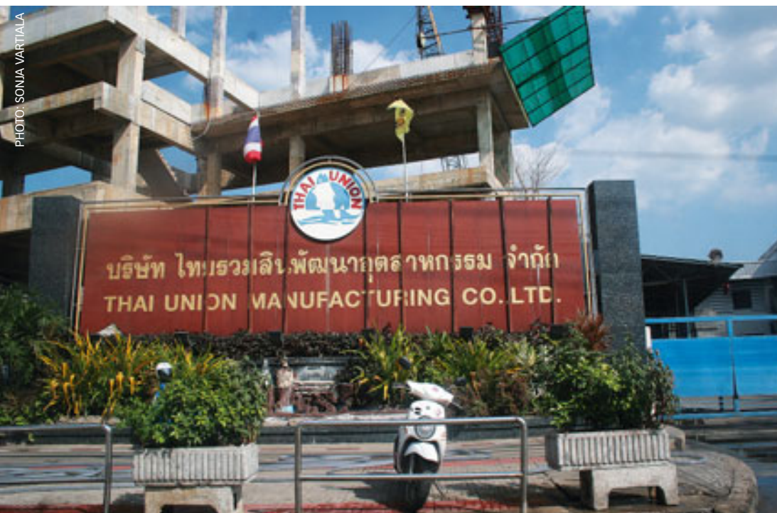
Thai Union Manufacturing is situated in Samut Sakhon, Thailand.

Workers at TUM reported recruitment payments between 1 500 and 5 000 baht. Some of the workers reported that their friends had been cheated by job recruiters, promised a job at a tuna processing factory but after entering the country discovered that there was no job on offer. TUM told Finnwatch that it had forbidden the collection of recruitment