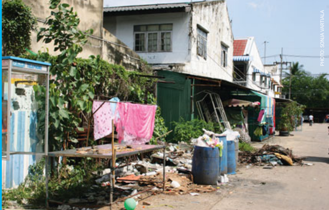
Tuna factory workers living area in Mahachai.

The interviewed workers at TUM reported only receiving four days of paid and two days of unpaid annual leave per year. When Finnwatch met TUM's representatives they explained there to be a misunderstanding. According to the factory, the workers are being provided six days of leave out of which four days can be taken at any occasion decided by the workers themselves and two days on dates decided by the employer only.